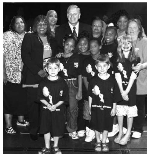
Ohio Gov. Ted Strickland and AFSCME child care providers at Council 8's 2007 convention.

In addition to Ohio, AFSCME represents about 150,000 family child care providers in California, Iowa, Kansas, Michigan, Minnesota, New Jersey, New York, Oregon, Pennsylvania and Wisconsin.