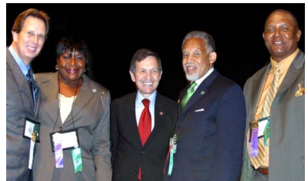
Congressman and presidential candidate Dennis Kucinich, center, and Ohio Council 8's table officers.