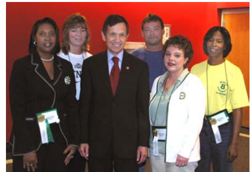
Congressman Dennis Kucinich, center, escorted by a committee of delegates.

"What kind of a system do we have here? It's upside down," he said.