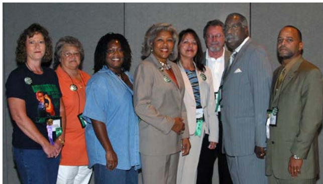
Ohio House Minority Leader Joyce Beatty, center, and her escort committee.